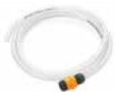
Suction hose with quick coupling