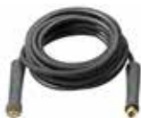
Rubber delivery hose kit